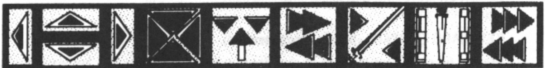
LEFT UP/DOWN RIGHT STOP JUMP RUN ATTACK DEFEND FLEE

The game may be controlled from the keyboard, joystick or mouse. Whilst you are playing Barbarian you will see a strip of icons at the bottom of the screen. Moving the cursor to the far right or left of the strip will reveal a second icon strip which also contains the game status information. Or press the spacebar if you're using the keyboard.