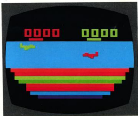
Canyon Bomber Playfield

In one-player Canyon Bomber games you compete against the computer for a higher score. A miss is recorded each time you fail to hit a target in the canyon. A miss is also recorded if your plane travels across the canyon without dropping a bomb.