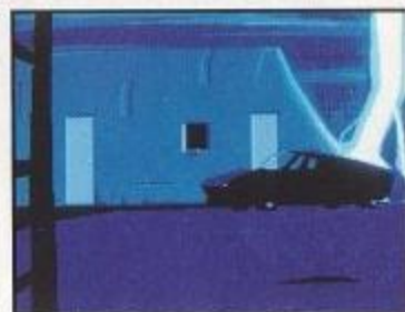
Lightning hits the laboratory

Plug in the game pak and turn on your Super Nintendo Entertainment System. After the Out of this World logo vanishes you may press any button to get to the Start / Continue screen. You may choose either Start or Continue by pressing up or down on the control pad. Select 'Start' and press 'B' to start the game. Once the game has started, push up on the control pad to swim to the surface of the water.