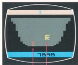
Phone Part E.T.