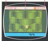
Figure 4—E.T.'s Landing Site