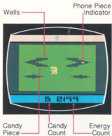
Figure 1—Well-Pocked Surface

sites on Planet Earth. Four of these are full of pitfalls—they are dotted with deep wells (Figure 1) into which E.T. can fall (Figure 2). A fifth site (Figure 3) shows Elliott's house, the Institute of Science, and the FBI building. Here, E.T. is taken by the scientist to be studied. The sixth site (Figure 4) is a forest setting where E.T. first lands and where the ship will land to pick him up.